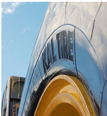
MOLD CURE Bead to bead quality

Our OTR retreads come in two different formats: