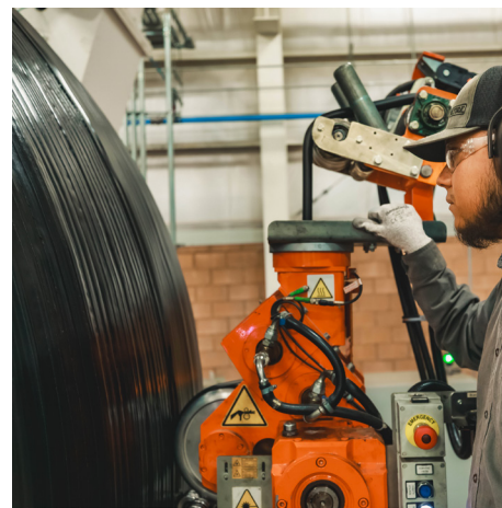
SMOOTH & GROOVE Custom manufacture of the right tire design for your application

Our extensive repair service covers small spot repairs to large section repairs in giant tires. With our steel cable replacement repairs, we help to put tires with normally unrepairable damage, back into service.